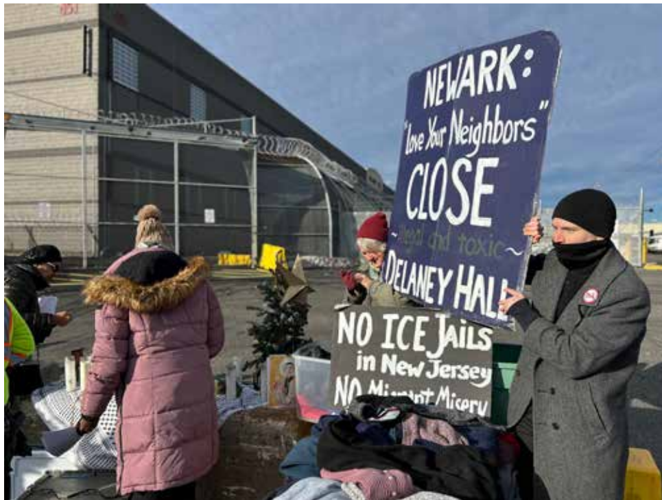
During our solidarity work at Delaney Hall in Newark, providing comfort and support for detained immigrants and their families, we hear the harrowing stories of people fleeing situations of persecution and violence. Many times, those stories include gun violence.

The Mexican Government makes around 20,000 arms trace requests to the US Bureau of Alcohol, Tobacco, Firearms and Explosives (ATF) per year. The results showed that around 70% of the traced guns were purchased in the United States.